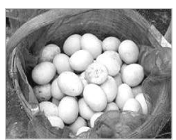
Uncolored salted eggs