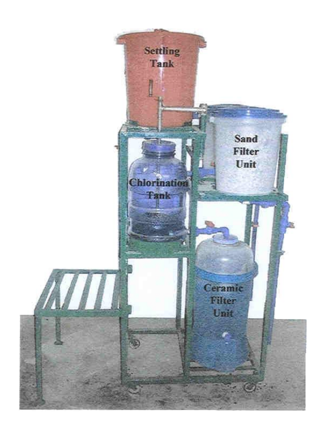
Fig. 1. The locally fabricated small-scale water purification system